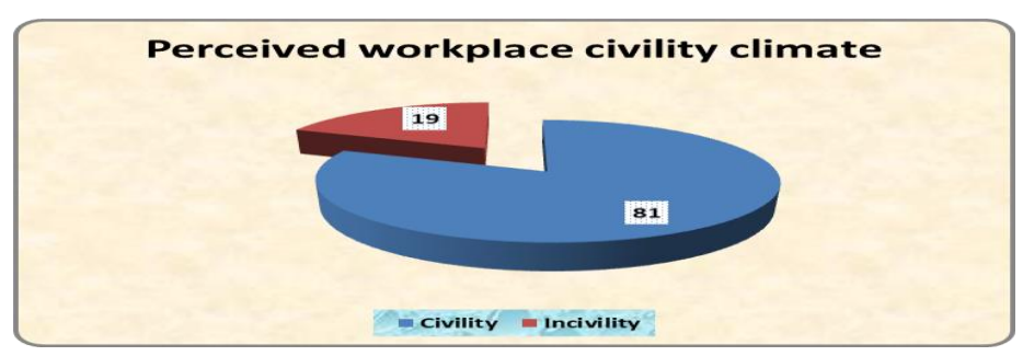
Figure (1): Distribution of staff nurses perception toward perceived workplace civility climate (n= 200)