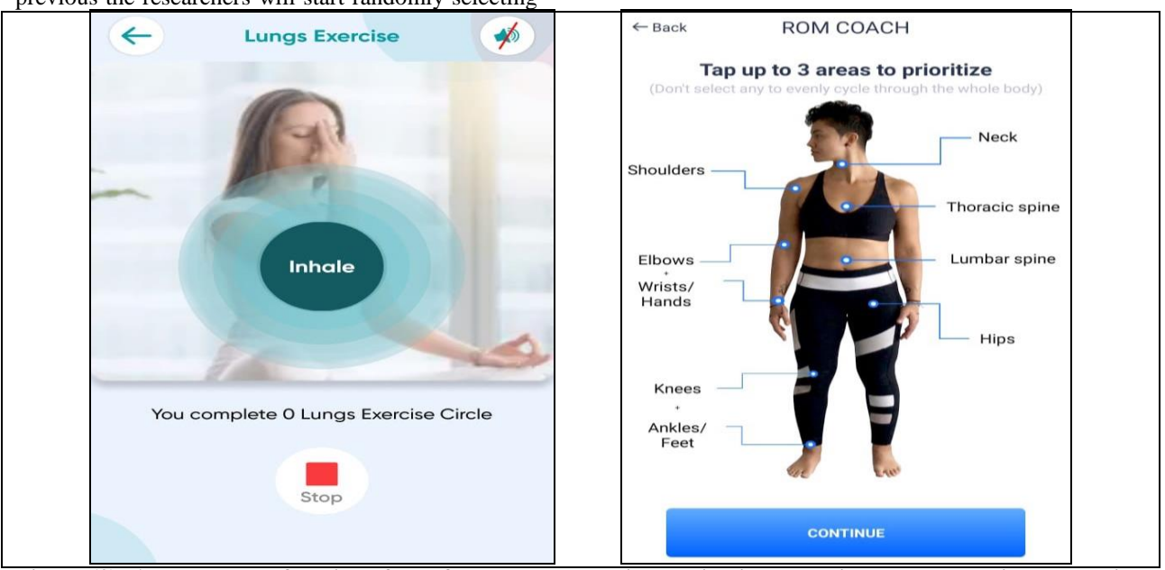
Figure (2): A screenshot of the interface of the selected mobile applications used in nurse-led patient education using telehealth and artificial intelligence

The researchers met each participant individually to explain the purpose, nature of the study, benefits of adherence to the intervention, and all the previously mentioned ethical considerations. First, each participant was asked to sign the consent form; then, the researcher conducted a structural interview to fill up the two research tools to conduct the initial research assessment. Regarding the study group, the researchers helped them download the mobile application and explain how to use it individually. Then, each participant was interviewed individually (face to face) for 45 minutes to give them instructions about how to use mobile apps to conduct pursed lips breathing exercises and range of motion exercises and let the participants perform the exercises under the supervision of the researchers to ensure that the participants could do the exercises correctly. Then, the searchers interacted online with the participants via video call or Zoom meetings 3 times per week for 3 weeks to follow them while conducting the previously mentioned exercises and to ensure that the participants correctly used the selected mobile application to answer any questions. During this phase, the researchers observed the control group to ensure they only received routine care.