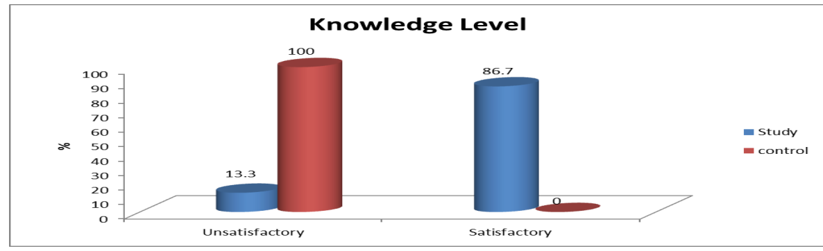
Fig (1): Comparison between level of patient's knowledge about transurethral resection of bladder tumor obtained by study and control groups after application of nursing instructions (n=60).